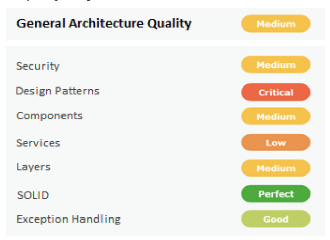
Figure 8: Architecture assessment summary.

Architecture quality assessment contains an expert's conclusion regarding the data model and core structure of the software. During the assessment's administration, we analyze services, layers, exception handling, design patterns, infrastructure and recycling components, and more [10, 11].