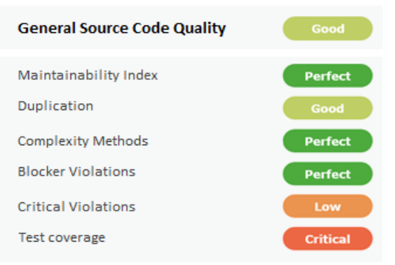
Figure 3: Source code quality assessment summary

Figure 3 shows the Summary Source Code Assessment results where the most pressing issues are related to the unit test coverage and critical rules compliance violations.