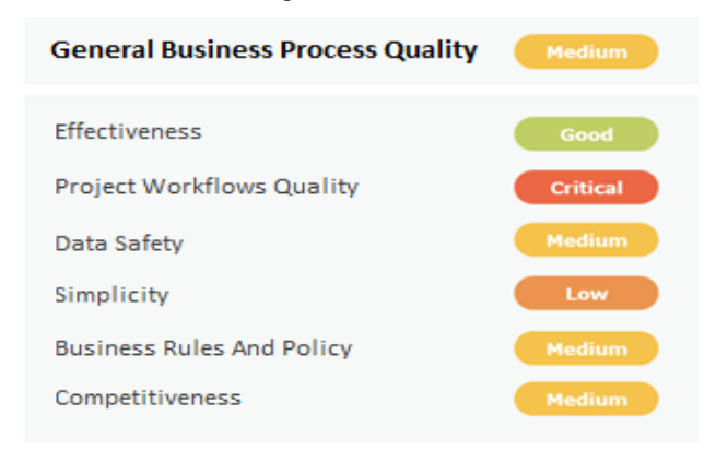
Figure 7: Business logic assessment summary.

Business logic assessment determines whether software aligns with necessary business processes. This kind of assessment considers feedback from various focus groups, including customers, end-users, community, management, etc. The business logic assessment relies on six main metrics: data safety, project workflow quality, effectiveness, simplicity, business rules and policy, and competitiveness. An example of the business logic assessment is shown in Figure 7.