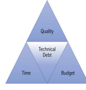
Figure 1: Agile Triangle

For any software product, it is natural to accumulate some amount of technical debt in the development process. Therefore, it makes academic and practical sense to manage tech debt. Various reviewed sources suggest that technical debt should be managed within the Agile Triangle, where there are three different dimensions - budget, time, and scope [3] - conflicting since it is not feasible to develop high-quality software with a low budget in a short time. So, as shown in Figure 1, if we are focused on one corner, we are going to weaken the other two.